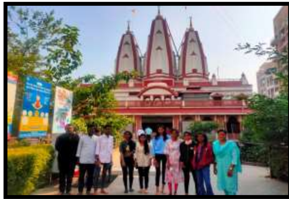
Iskon Temple, Pune