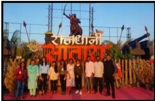
Amusement Park, Khambatki, Satara