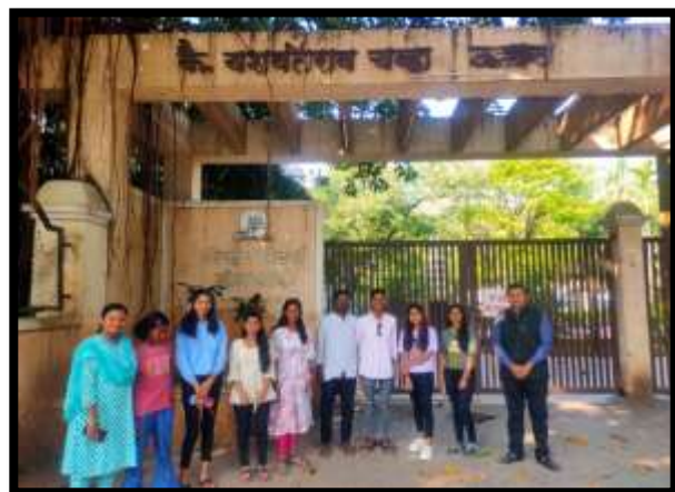
Seven Wonder Theme Park, Pune

Brief Report of the Activity: Title: One-Day Educational Tour to Patan-Pune-Jejuri