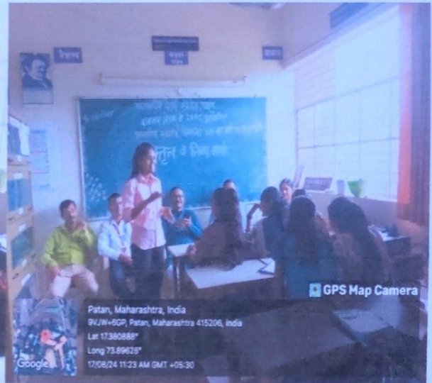
A participate student giving a speech