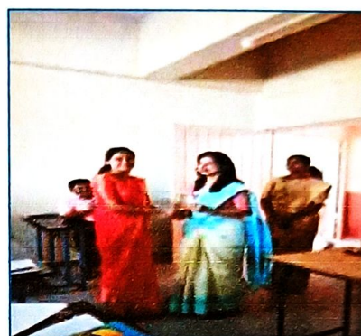
Felicitations of teachers

Objectives of Activity: Educate and awareness rise about gender equality. celebrate women's achievement in all fields.