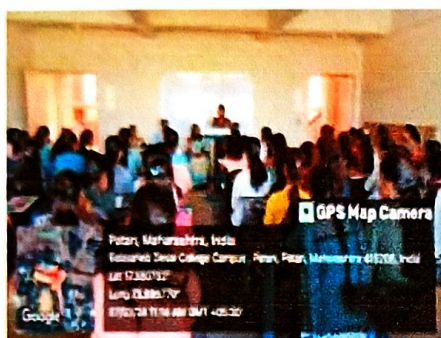
Celebration of International Women's Day